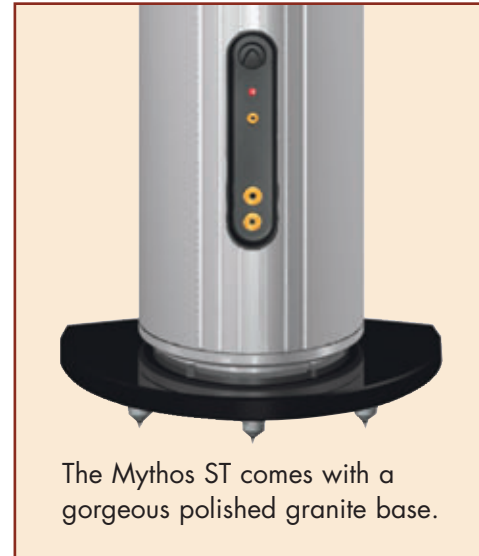
The Mythos ST comes with a gorgeous polished granite base.

The Mythos STs can be combined with their matching center channel speaker (Mythos Eight) and surrounds (Mythos Gem XLs) for an exceptional surround system that, although not inexpensive, offers unmatched value.